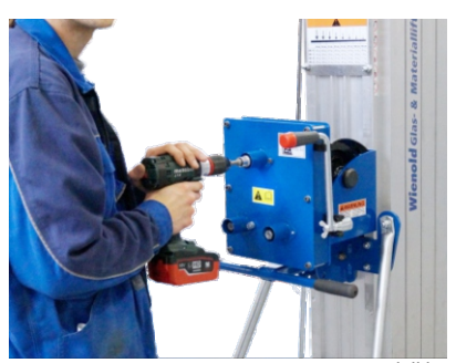
Drive: 3- step drill kit